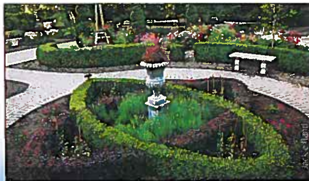
Visit Gardens Reflecting La Crosse's Many Global Sister Cities