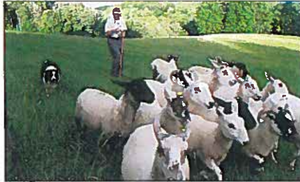
Littledale Sheep Farm

The La Crosse International Friendship Gardens showcases gardens typical of La Crosse's sister cities in France, Russia, China and Germany. Today's special lunch is at Fort McCoy, a Total Force Training Center for all branches of America's armed forces, followed by an exclusive tour. Stella Jones Corporation—Bangor Division is a manufacturer of treated railroad ties. Situated on 140 acres, the plant trims, grades, air dries and treats 1 to 1.5 million ties each year. Dine at Ishnala, a traditional supper club by Mirror Lake State Park. Overnight in the resort town of Wisconsin Dells. B, L, D