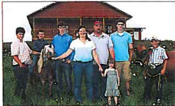
The Bekkum Family of Nordic Creamery