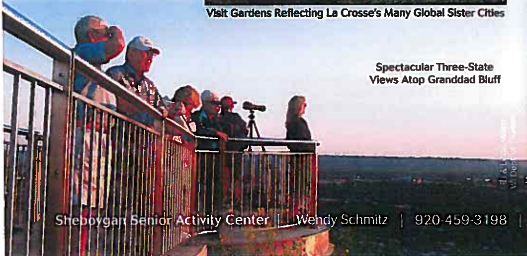
Spectacular Three-State Views Atop Granddad Bluff